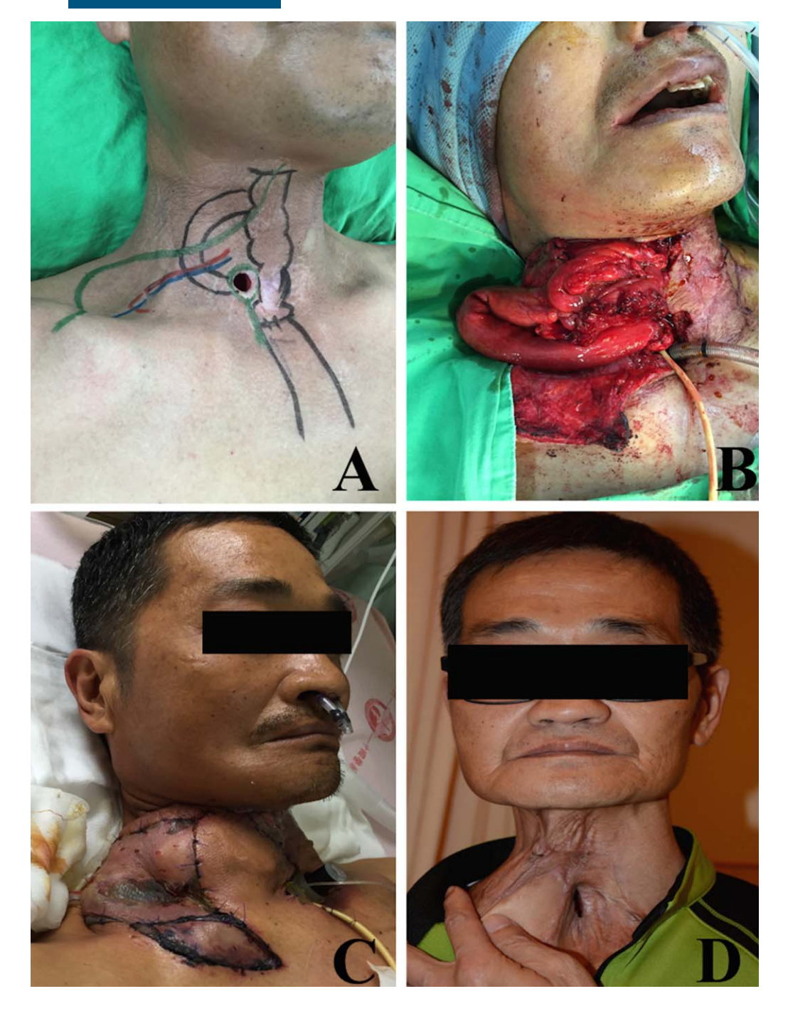
FIGURE 3 A, Voice reconstruction with free ileocolon flap was planned. B, lleocolon flap transferred to the hypopharynx and perfused by the right rTCA artery. C, At ten days, post-operative picture showed a viable flap with complete take of overlying skin graft. D, At eight months of follow-up, picture showed the patient adjusting pressure on the voice tube as part of the speech training program

(rTCA) was detected. The rTCA was deemed reliable for microanastomosis, only if there was a good size match with the donor pedicle and the spurt test was adequate (at least 5 cm).